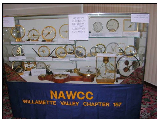
Our Display at the Regional