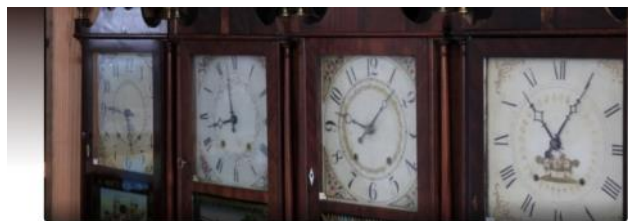
Cog Counters: Chapter #194 of the NAWCC

I am a relatively new Cog Counters member. When I joined, I noticed that other than the yearly Journal, chapter meetings at Southern Ohio Regional and National, and the picnic prior to East States Regional, there was no real way to communicate as a chapter other than by personal email or by phone.