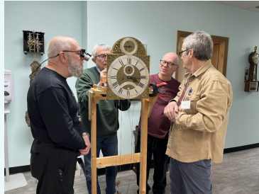
Participants practiced "house calls" during the workshop.