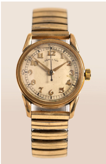
A 1946 Hamilton Secometer, Museum catalog no. 94.28.43.

On this date, E. W. Drescher of the Hamilton Watch Co. received US Patent No. 2372771 for a watch with a hacking feature for the seconds hand. Though Drescher applied for the patent in December 1940, it was not awarded until April 1945. This did not stop Hamilton from developing and manufacturing hack seconds watches for the US military in World War II.